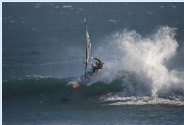
KMAC at PSC

This is 2010 and you've gotta change with the times! Flip that front hand over and get knuckles up!